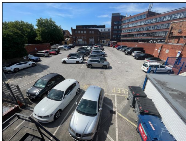
Rear car park

Interested parties are advised to make independent enquiries in this respect.